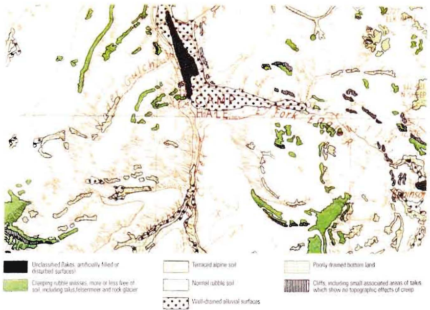
From "Extended Uses of the Method of Orthogonal Mapping of Traces of Parallel Inclined Planes with a Surface, Especially Terrain," drawn by Norman J. W. Throver. TOP: Central portion of the general relief map of Camp Hale, Colorado. BELOW: An enlarged section of the map with other surface-type information added; both maps are planimetrically correct. From The International Yearbook of Cartography , volume III, 1963, Bertelsmann Verlag, Gütersloh, Germany (unpaginated).