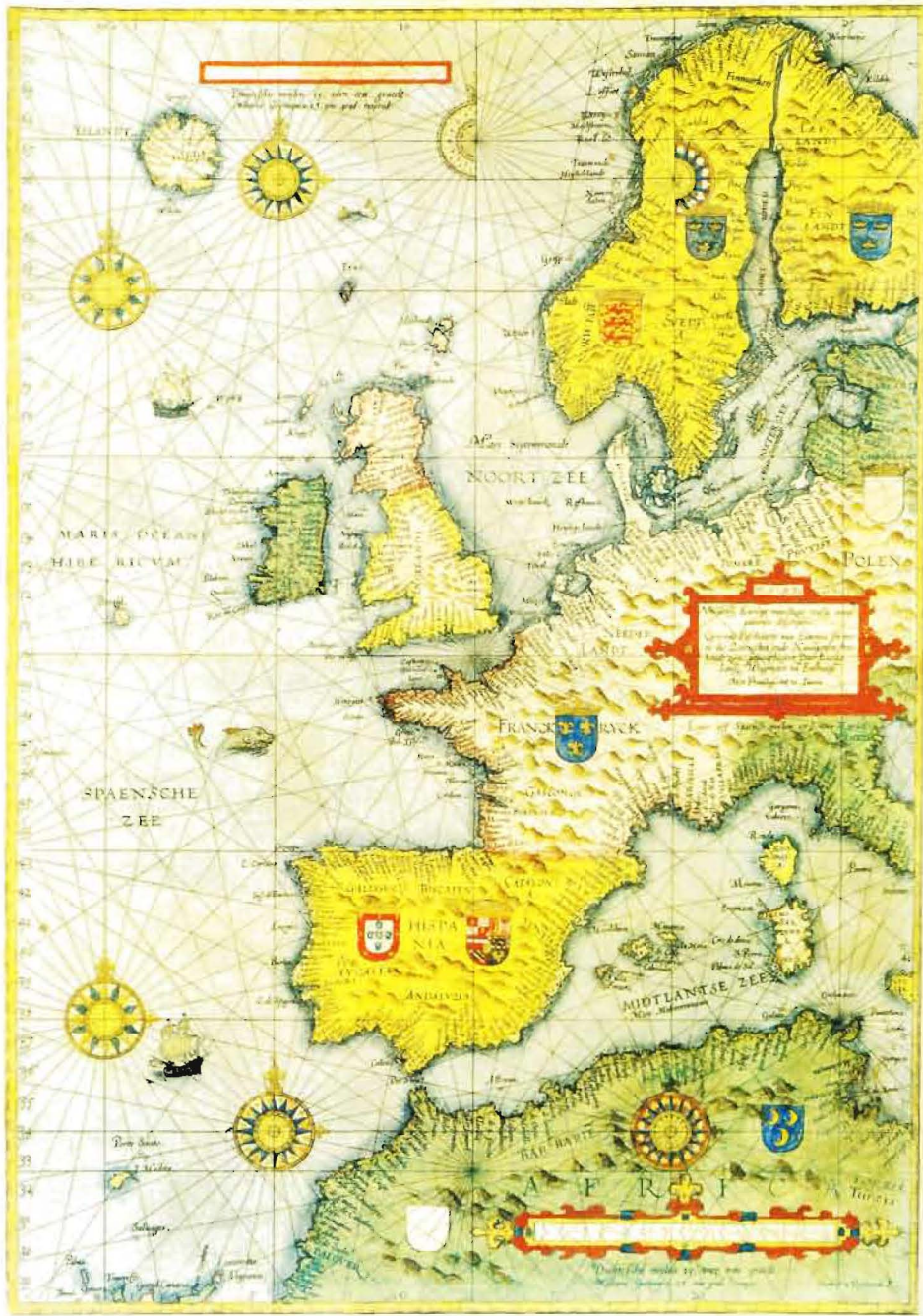
Figure 7. Chart of Western Europe from The Mariner's Mirrour (London: 1588), a translation of Spiegel der Zeevaert by Lucas Janszoon Waghenauer (1584), edited by Sir Anthony Ashlcy.